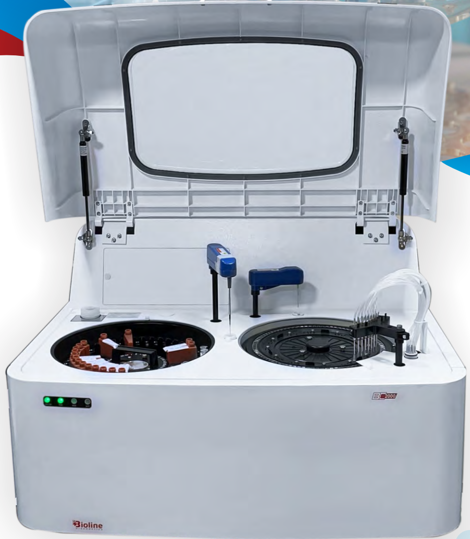
Fully Automatic Chemistry Analyzer

BC 2000 Fully Automatic Chemistry Analyzer